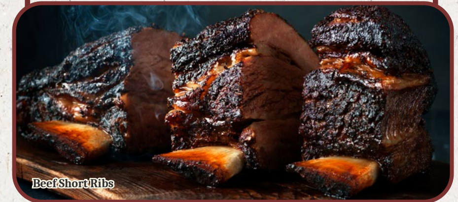
Beef Short Ribs