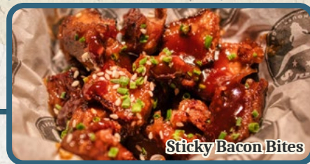
Sticky Bacon Bites

Charred bacon bites in a bourbon glaze served with sour cream dip.