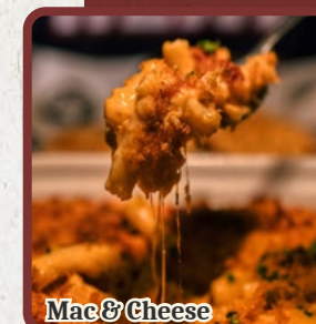
Mac & Cheese