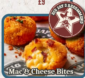
Mac & Cheese Bites